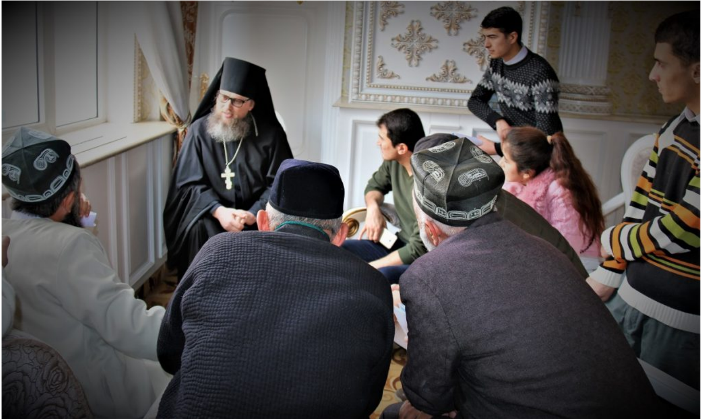
Representatives of various religions in Dushanbe at the interfaith festival - "Tajikistan is our common home" , organized by the Representative Office of the Institute for War and Peace Reporting in partnership with the Committee for Religion, Regulation of Traditions, Celebrations and Rites under the Government of the Republic of Tajikistan.

There are no visible conflicts on the basis of ethno-religious hostility in Tajikistan. However, if the problem is not visible, this does not mean that it does not exist. The principle of solving problems as they arise is not effective in the long-term perspective, because it involves resolving symptoms, eliminating the consequences, limiting the growth of the conflict and, if possible, restoring the previous status quo, but not finding the key cause of the conflict. Implementation of the tolerance policies as a set of preventive measures at the horizontal level (the relationship between people) and at the vertical level (power - society) will reduce the likelihood of such conflicts. An important condition: the right to access a public pie (pork barrel) and to the resource of power, will satisfy, if not all interest groups, then most of them.