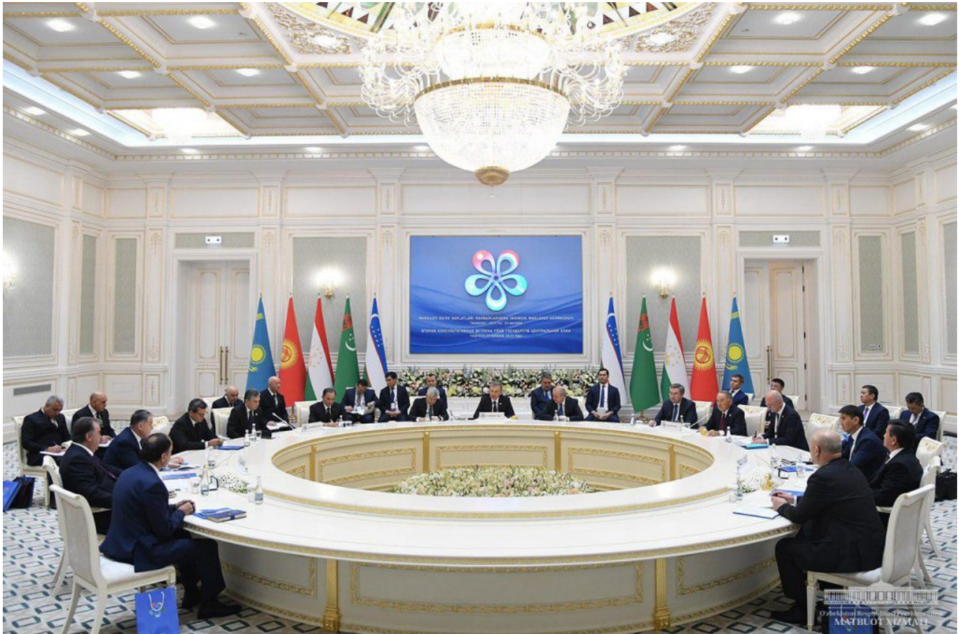
The key success of the meeting in Tashkent was the adoption of a detailed joint statement, in comparison with the first meeting.

A distinguishing feature from the first meeting was that President of Turkmenistan Gurbanguly Berdimuhamedov participated in it, which can be attributed to the clear victory of Uzbek diplomacy, due to the inactive participation of the Turkmen leader in regional initiatives, except for the International Fund for Saving the Aral Sea. Perhaps the head of Turkmenistan, on his arrival, sent a signal to neighboring states about his readiness to engage in integration processes, with main focus on increasing the transit and transport potential of the region and strengthening water security and borders with Afghanistan.