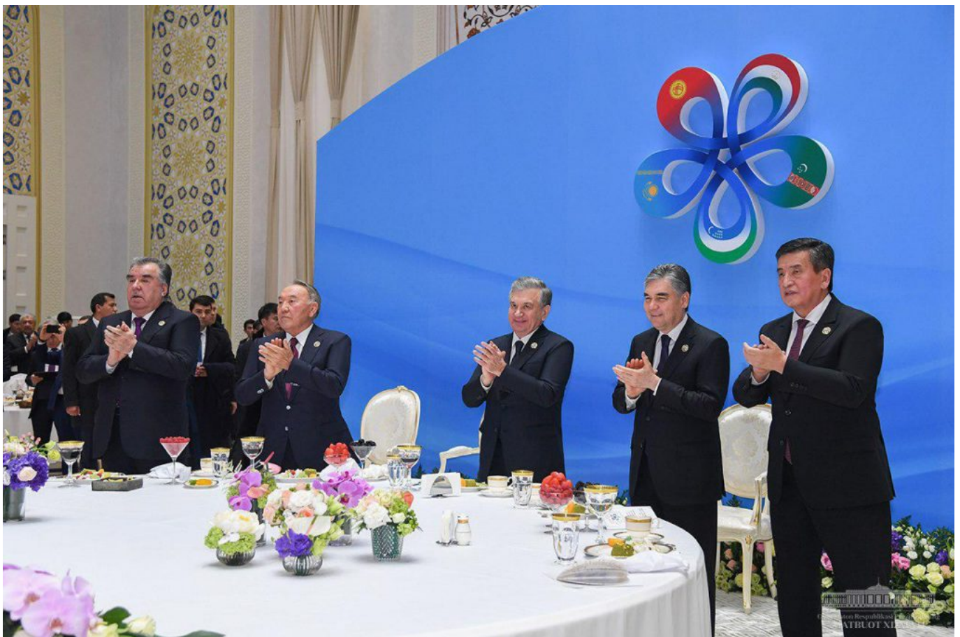
In honor of the heads of Central Asia states, an official reception was held on behalf of the President of the Republic of Uzbekistan.

The statement highlighted several points on the deepening of cultural and humanitarian ties and youth support, which suggests that countries recognize the presence of significant human potential in the region in the person of the younger generation. This cooperation can be strengthened by cooperation between educational institutions of the Central Asian countries, and on the sidelines of the Consultative meeting, it is possible to hold forums of university rectors of the region in the future. Nursultan Nazarbayev mentioned during the meeting that he was ready to allocate 10 grants to each country in the Central Asian region for studying at universities in Kazakhstan. [3] In addition to this initiative, it is possible for regional universities to develop a joint master's program under the working title "Central Asian Studies" with training in various cities of the region in order to deepen knowledge about Central Asia and prepare future specialists in the region.