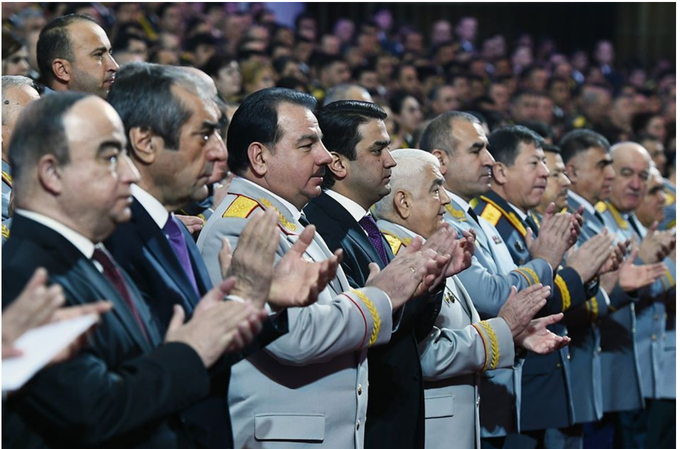
Tajik leaders, following the example of President Emomali Rahmon, are transferring part of their salaries to the fund for the fight against COVID-19. Illustrative photo.

On April 1 of this year, a special bank account was opened in Tajikistan to raise charitable funds to fight the spread of COVID-19.