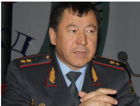
The Head of the Ministry of Internal Affairs Ramazon Rahimzoda.

The state news agency “Khovar” reports that among them are the speaker of the lower house of Parliament, his assistants and deputies, the leadership of the Ministry of Industry and New Technologies, the Committee on Youth and Sports, the Chairman of the Khatlon region, employees of the Antimonopoly Agency, the Academy of Management, and the State Academic Opera and Ballet Theatre.