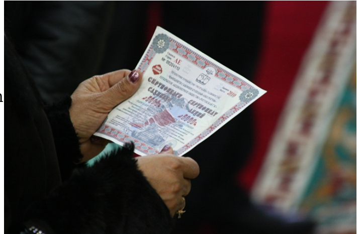
In early 2010, authorities distributed shares of the Roghun HPP.

According to experts, fundraising at the expense of the people resembles the fundraising for the construction of Roghun hydroelectric power plant (HPP). In early 2010, the Government of Tajikistan called on all citizens of the country to buy shares of the Roghun HPP. At that time, the government assured the public that the power plant could be built with public money. The media reported that citizens were often pressured to purchase shares in the Roghun HPP. For instance, drivers at checkpoints were asked to provide shares instead of car documents. In universities, students were not allowed to take exams without shares.