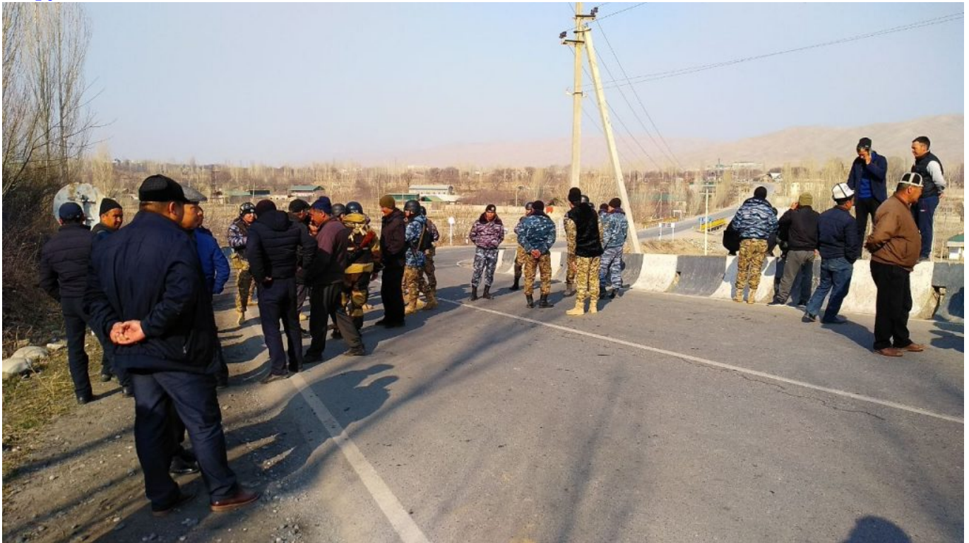
Blocked road in Aksai village.