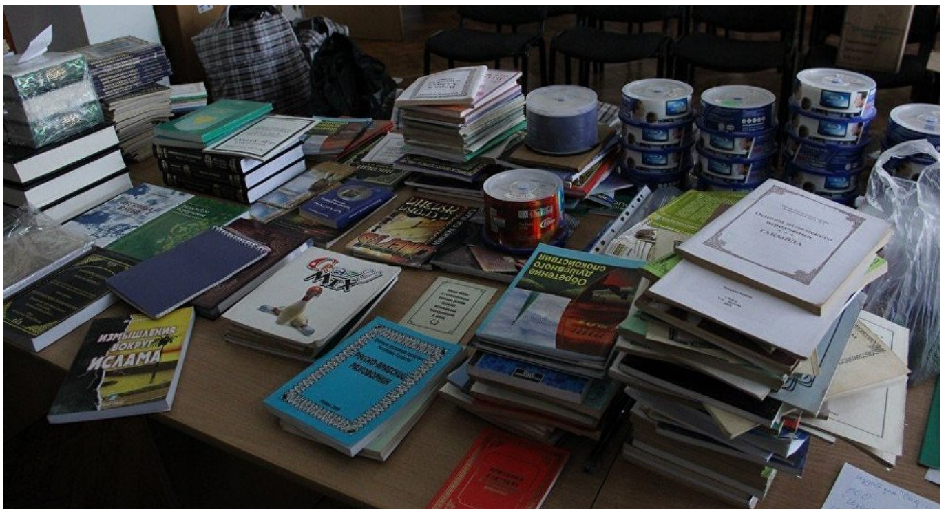
Extremist materials.

An analysis of existing media strategies on countering the spread of the violent religious extremist ideology online shows the need to implement measures to eliminate the reasons for increased attention to violent extremist narratives and to improve level of trust in society.